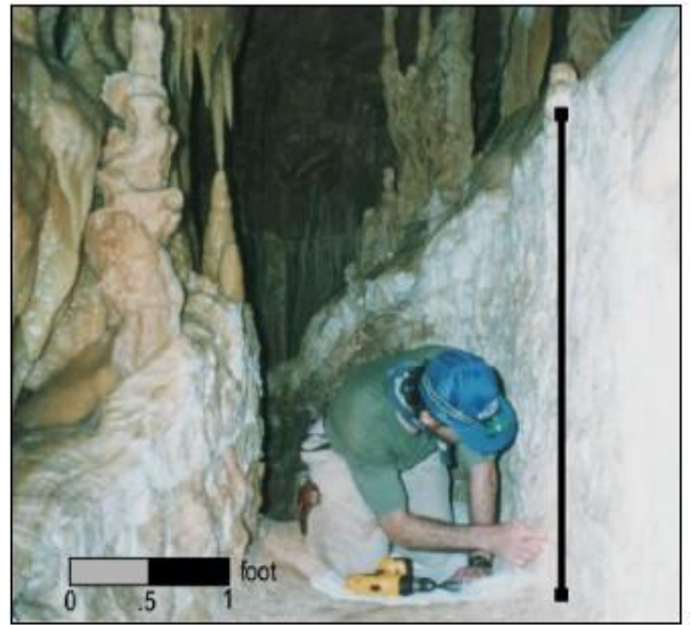
Flowstone Passage Natural Bridge Caverns