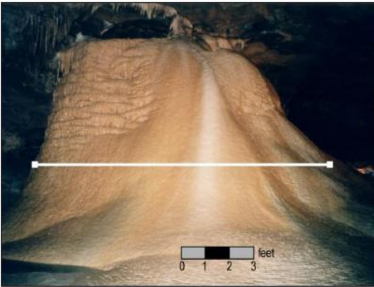
Flowing Stone of Time Inner Space Cavern

Use the scaled photographs below to estimate the diameter of the formations. Use the radius and the mean growth rate to calculate the approximate age. Be careful of the units. The scale only works for axes shown.